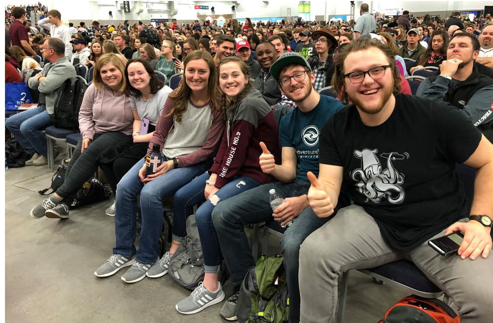
Some of the members of the Flock attended the CROSS conference in Louisville, KY last week learning how to live ON MISSION for Jesus.

Sign up for Orchard Hill alerts by texting the following words to 313131 :