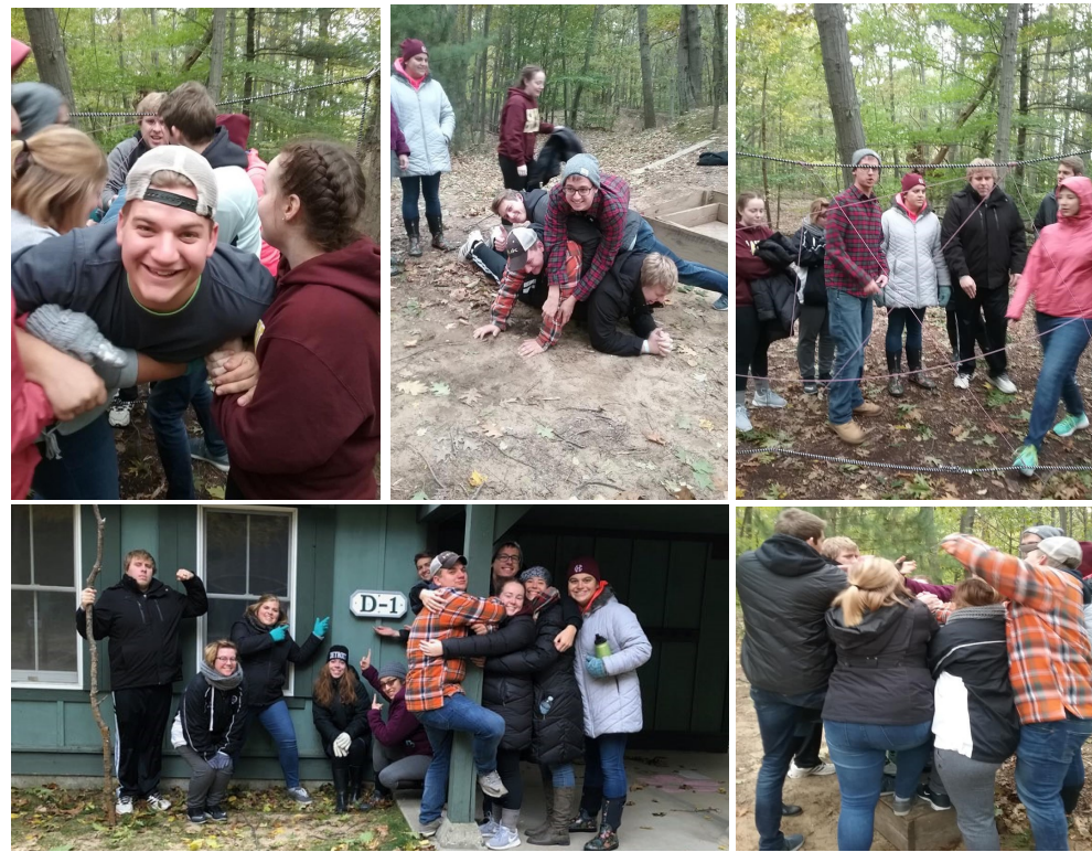
The Flock (19-30 year old mid-size group) went on a weekend retreat to Holland last week. They grew together in the Word and in some group building exercises!

Sign up for Orchard Hill alerts by texting the following words to 313131 :