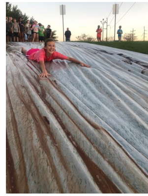
The high school and middle school youth groups kicked off by sliding into the fall season on top of a soapy, chocolatey slip n' slide!

Sign up for Orchard Hill alerts by texting the following words to 313131 :