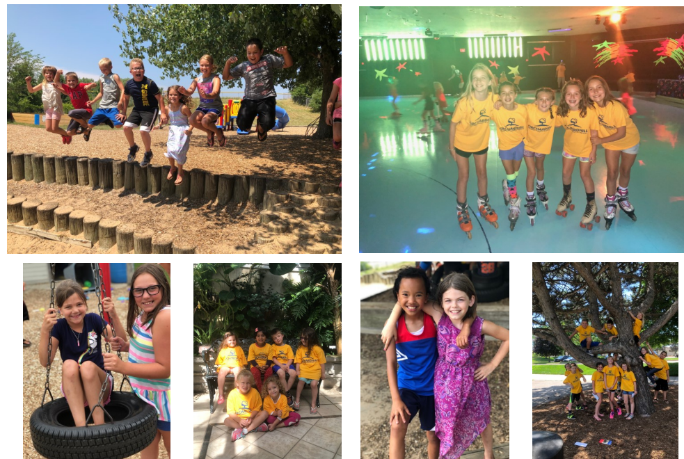
The Orchard Hill Child Care and Preschool kids are wrapping up another fun summer filled with games, field trips, and friendship!

Sign up for Orchard Hill alerts by texting the following words to 313131 :