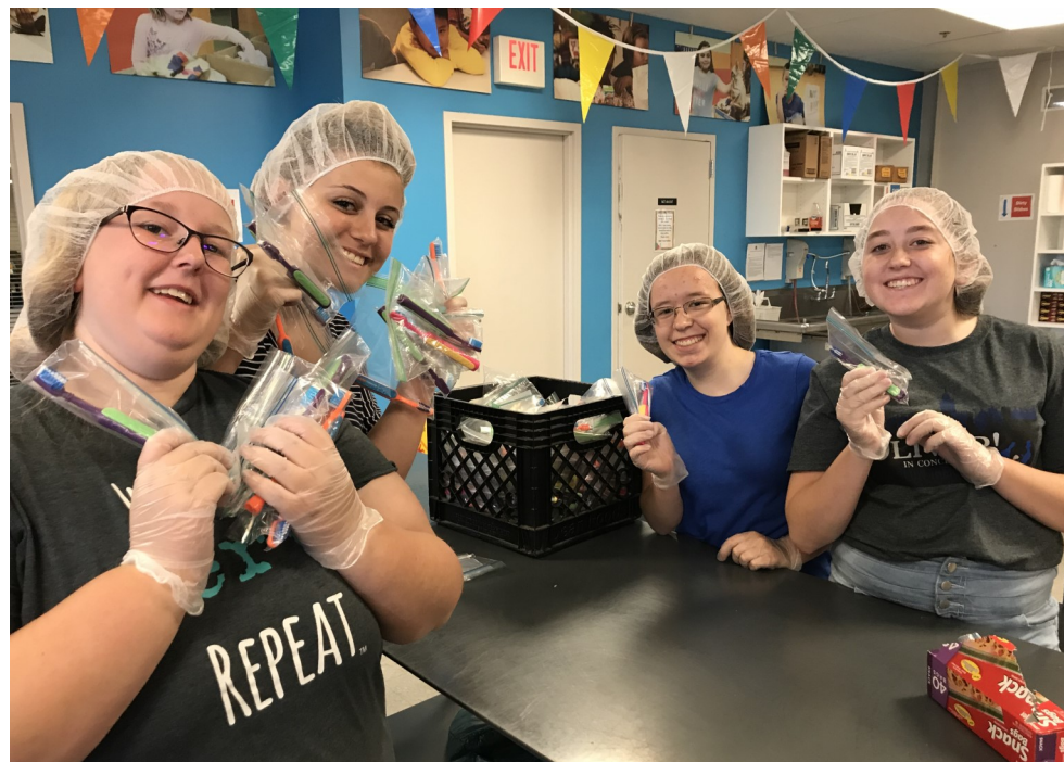
Our interns serving at Kids Food Basket as part of their ministry education and exploration!

Sign up for Orchard Hill alerts by texting the following words to 313131 :