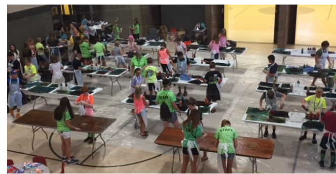
Here are some more photos of what was going on during Arts Camp week! Tie Dye and Mob Art were a part of Tuesday's busy day!

Sign up for Orchard Hill alerts by texting the following words to 313131 :