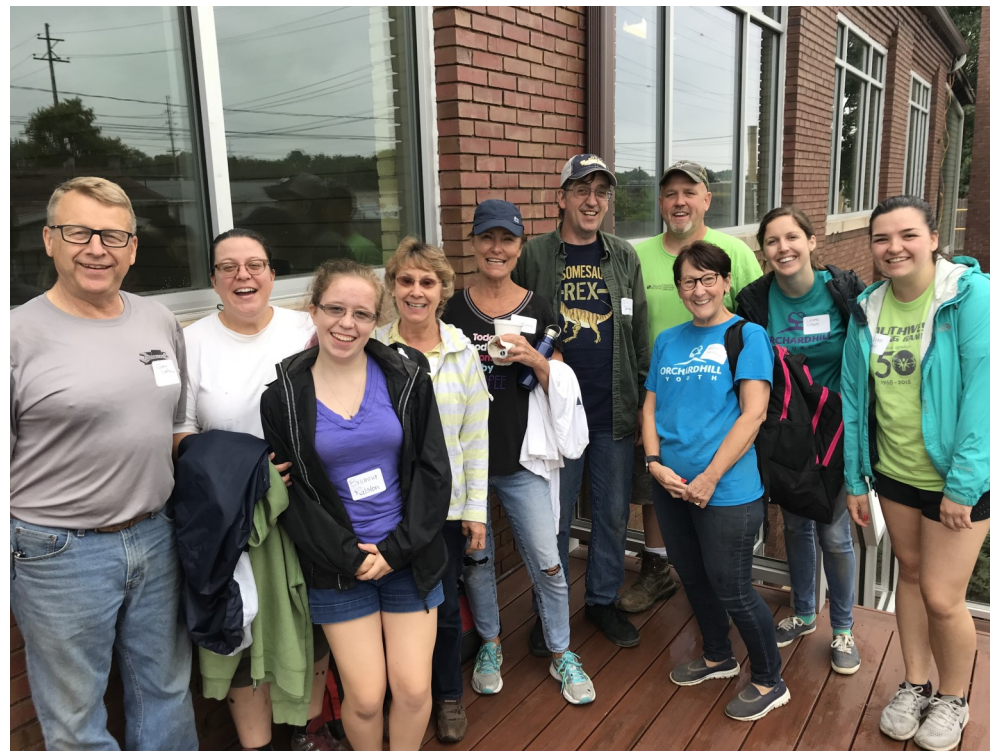
The June Servefest Saturday crew working with Cityfest and the ICCF at the Center for Community Transformation.

Sign up for Orchard Hill alerts by texting the following words to 313131 :