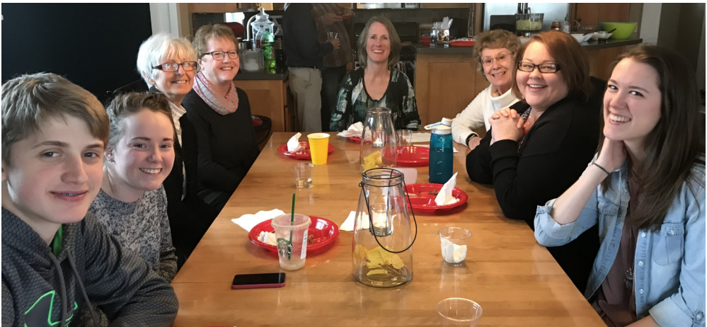
Our team of 20 from Orchard Hill at the Cityfest Friendship Evangelism Training on Tuesday night, learning how to share the gospel with others, both now and at the Cityfest outreach event in September!