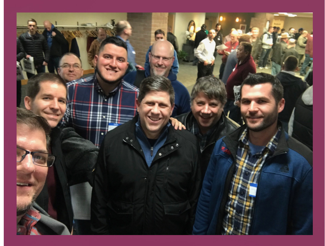
A few of the guys who attended the men's conference, Iron Sharpens Iron, last weekend.