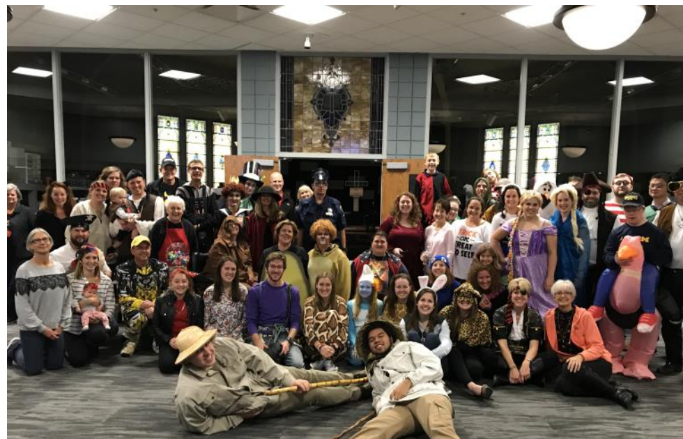
This year's Trunk or Treat volunteers welcomed in about 700 of our neighbors with the love of Christ and saw some of the best decorated tables yet! Thank you to all who helped to make this event possible. We are excited to see what fruit God will bring from this night!

Orchard Hill Church exists to see hundreds of families and individuals in our surrounding neighborhoods become committed followers of Jesus Christ.