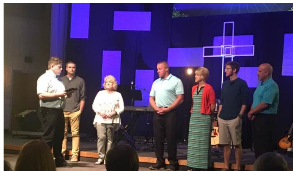
Our newest members were ordained into our leadership teams here at Orchard Hill.

1465 Three Mile Road Grand Rapids, MI 49544