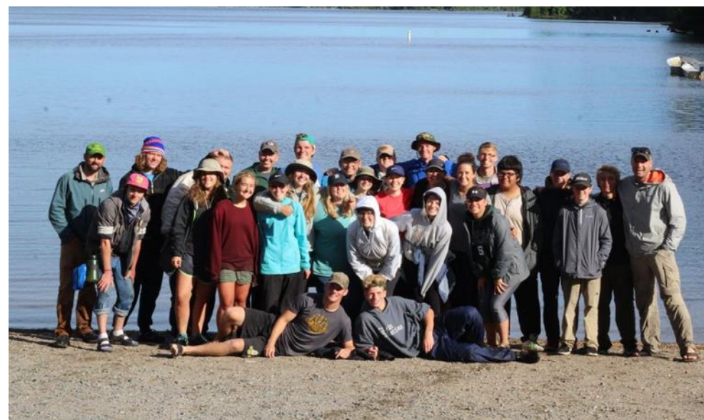
The High School Youth Group went on an Adventure Wilderness trip in Canada last week to spend some time learning how to walk spiritually with the Lord.