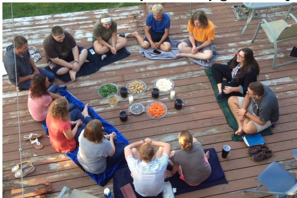
The high school youth group shared a Passover meal at House Church last week.