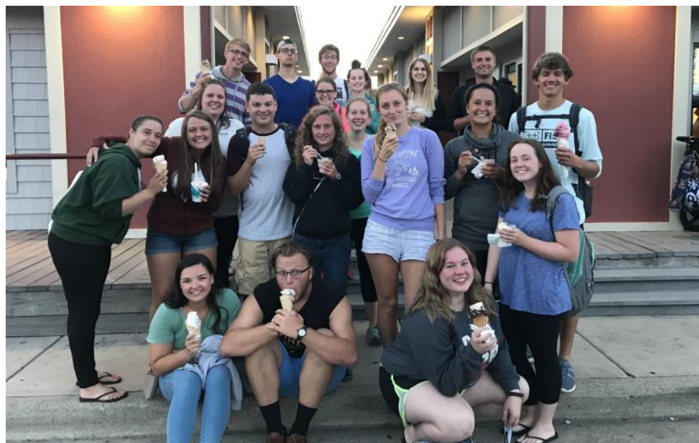
The Flock spent the weekend in Grand Haven for a quick retreat before the business of student life begins in the fall!