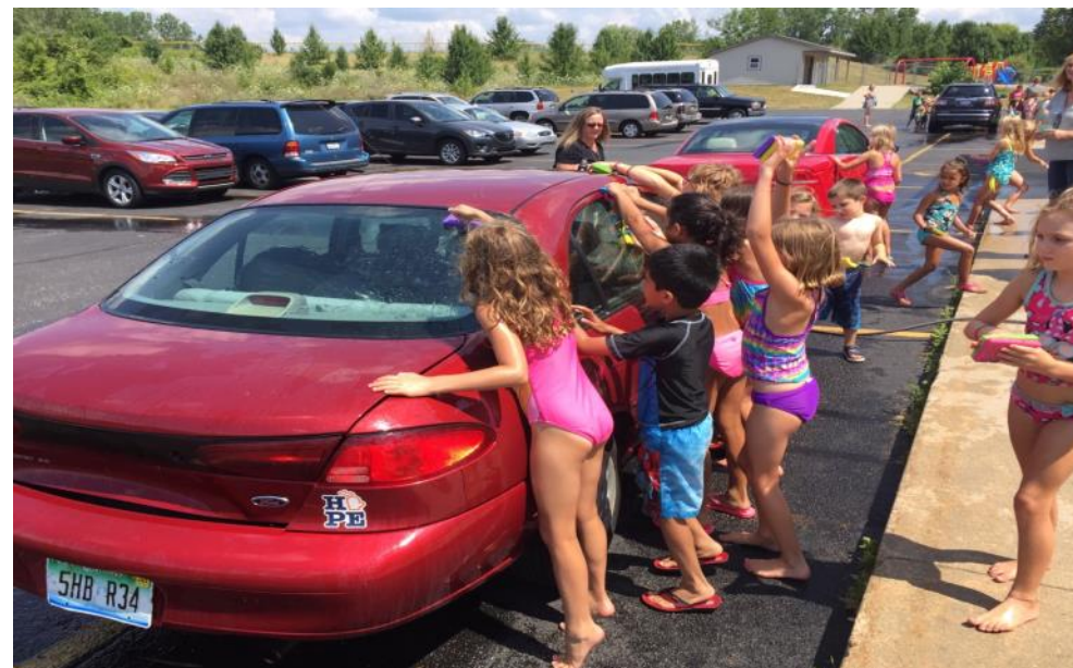
The Orchard Hill Daycare children hosted a car wash last week to raise money for their "Big Adventure Day!" They went to an indoor/outdoor water park in Battle Creek this past Wednesday.