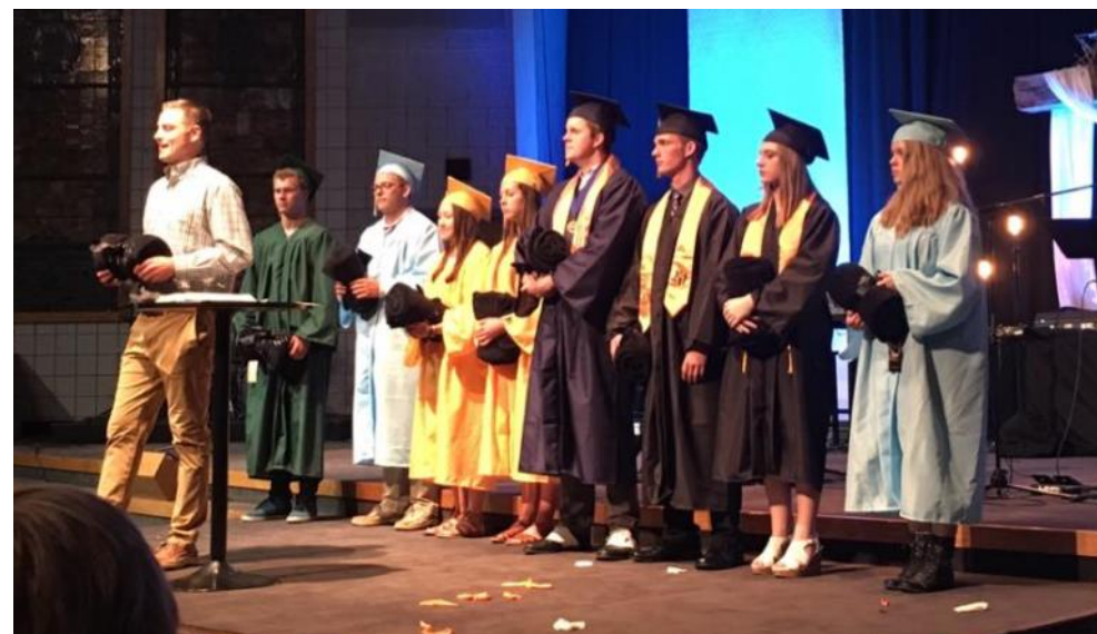
Last week we recognized our high school and college graduates. If you see one of these grads, make sure you tell them congratulations!