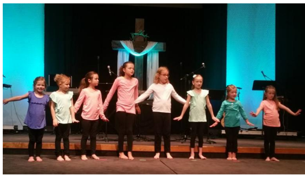
Last week we were blessed by our Lil' Worshipers as they dedicated a dance to mom's in honor of Mother's Day.