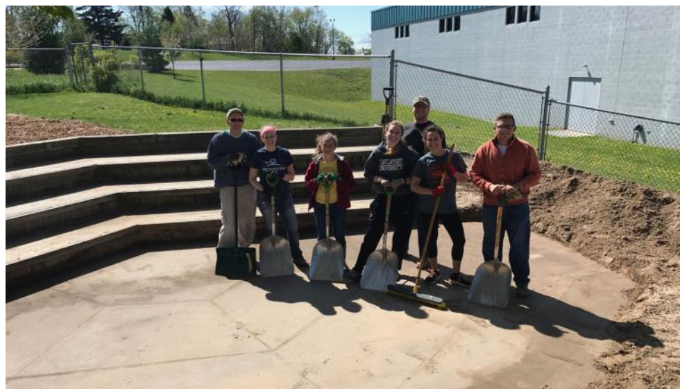
Orchard Hill holds an annual spring clean to keep our facilities looking fabulous for the summer months. Here, workers shoveled off the daycare playground and brought in new woodchips. Thank you to all that came out!