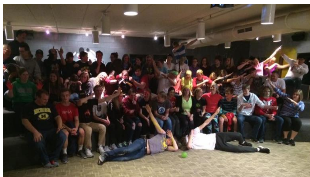
The high school and middle school youth groups hosted Remembrance Church's high school and middle school youth groups to a friendly glow in the dark broomball competition.