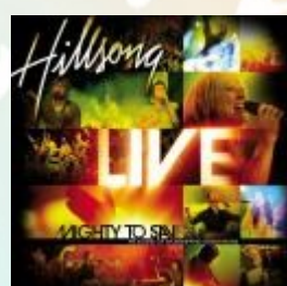
Mighty To Save