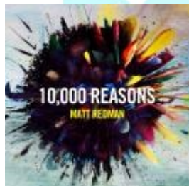
10000 Reasons (Bless The Lord)