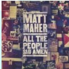
Lord I Need You