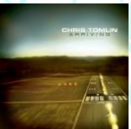
How Great Is Our God