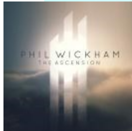
This Is Amazing Grace