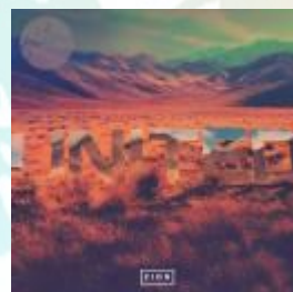
Oceans (Where Feet)