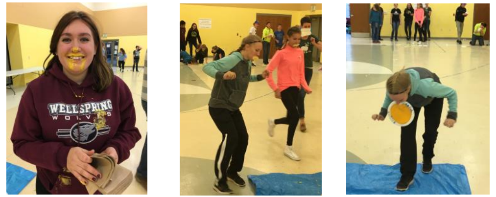
The Taco Bell night with the high school youth group was a blast! Here, the kids had to make a taco by carrying the ingredients in their mouths. Live mas!