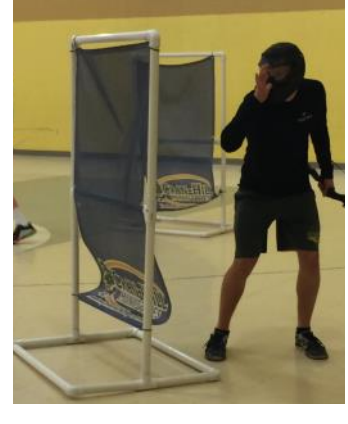
The High School Youth Group fun night last Friday. They played archery tag, nine square, did relay races, and watched March Madness.